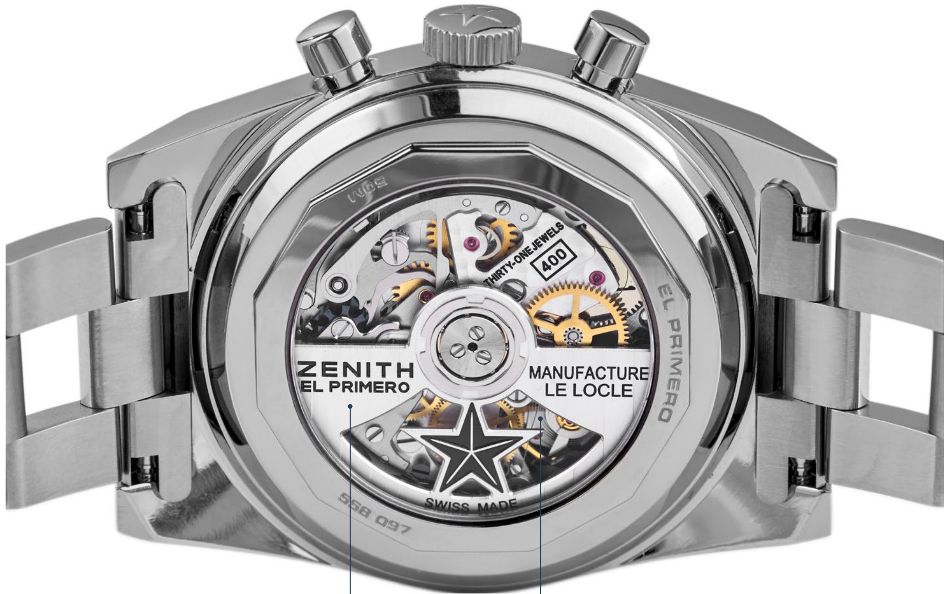
Self-winding El Primero caliber 400; 50-hour power reserve